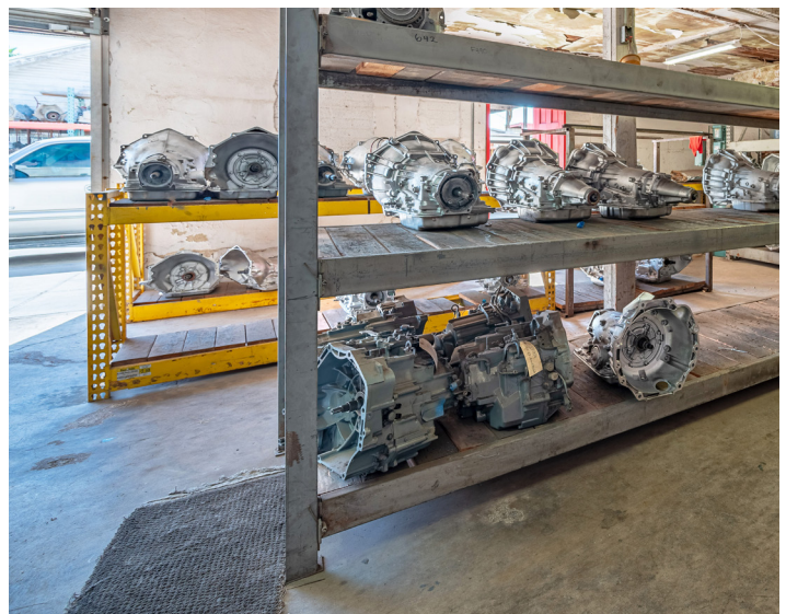
Pete's Transmission | Property Detail