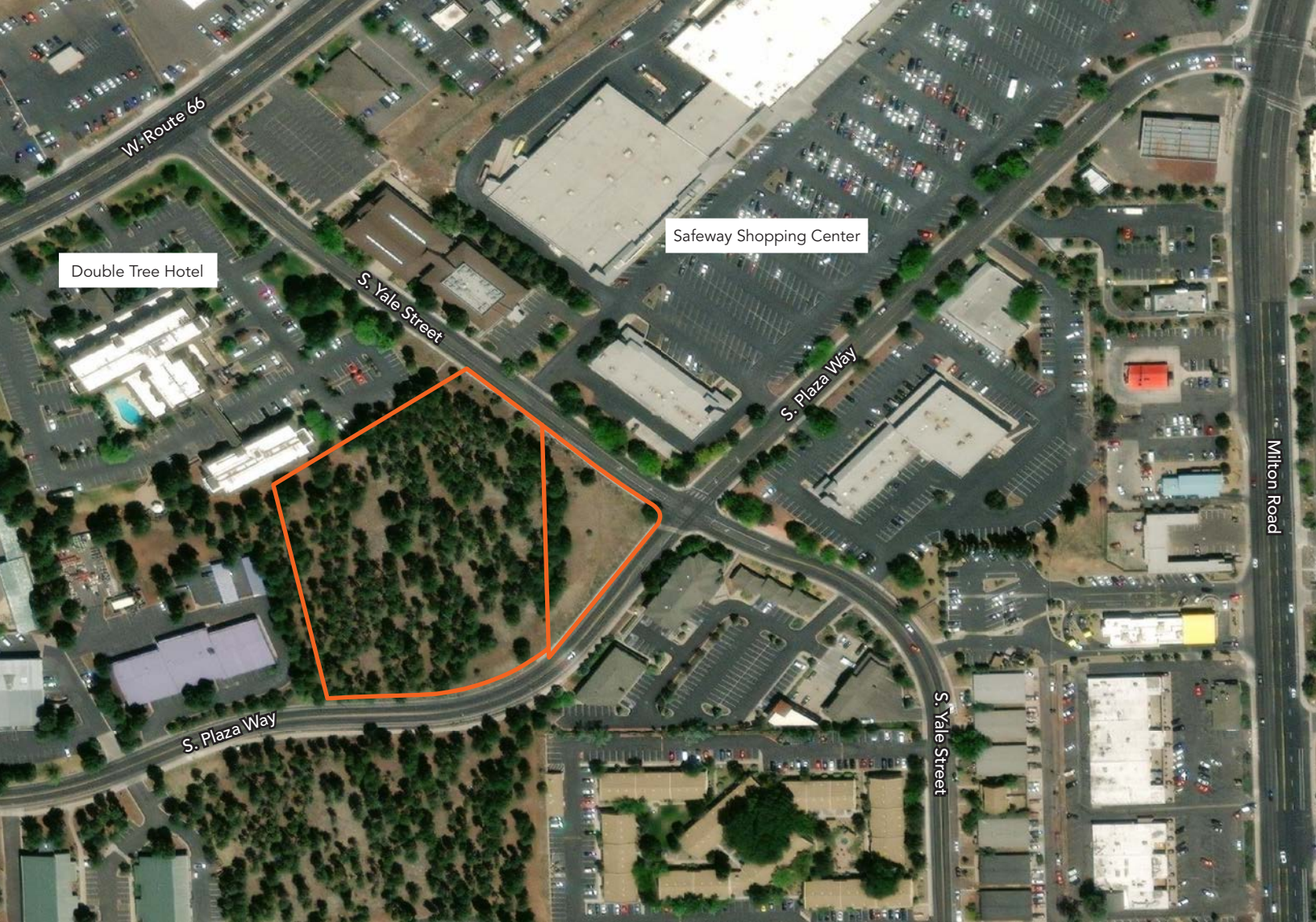
Excellent location near Flagstaff's major commercial traffic corridors